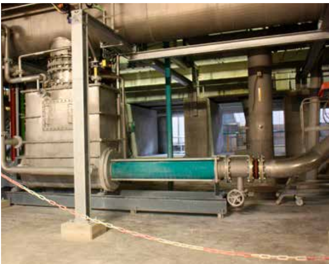
NEMO® pumps waste paper

The self-priming TORNADO® pump operates via displacement, transporting the conveyor medium continuously from the suction to the pressure side using two intermeshing rotors. Almost all types of media can be transported smoothly in this way, from low-viscosity and high-viscosity materials such as thixotropic or dilatant substances to sticky and non-sticky or shear-sensitive materials. The pump also handles particle sizes of up to 3" / 70 mm with ease. The transported volume can be regulated easily via the rotation speed. Volumes of up to 4,402 gpm / 1,000 m 3 /h can be achieved depending on size.