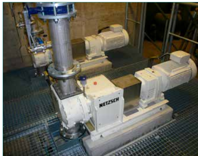
TORNADO® T1 conveying kaolin slurry