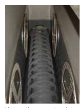
Hopper is customizable, spoked wheels have diamond plate surface